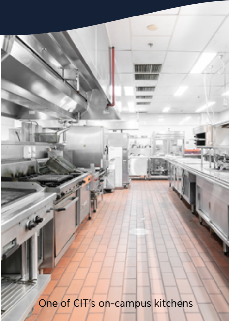
One of CIT's on-campus kitchens