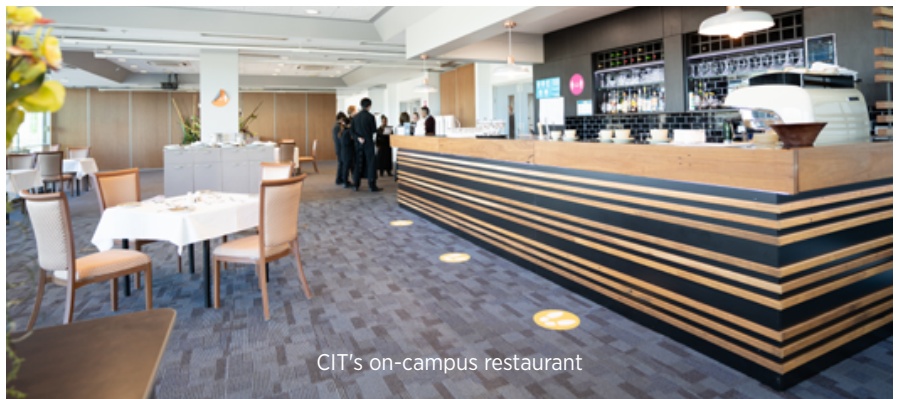
CIT's on-campus restaurant